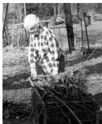
Rural elderly face unique challenges